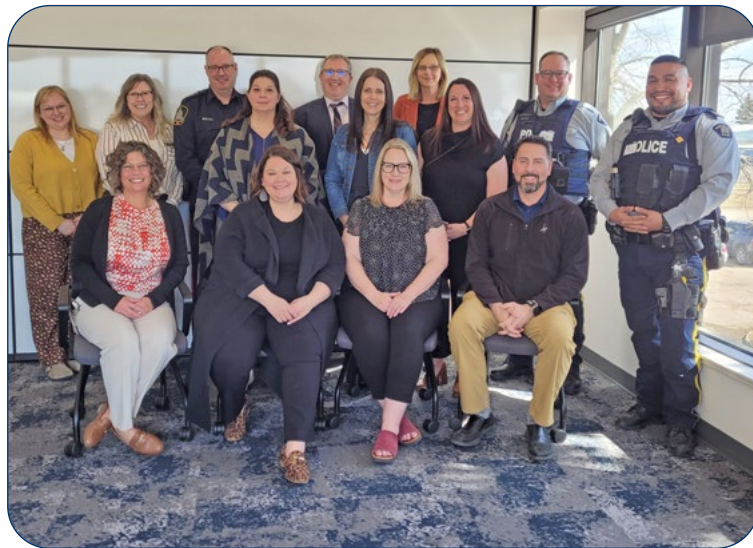
Members of EICS, Battle River School Division, Alberta Health Services, and the RCMP recently signed an updated Violence Threat Risk Assessment (VTRA) Protocol.

This reaffirmed agreement strengthens the collaborative approach to early intervention and supports the ongoing commitment to student safety,