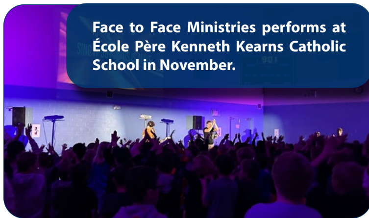
Face to Face Ministries performs at École Père Kenneth Kearns Catholic School in November.

through the ongoing support from the REAL Foundation.