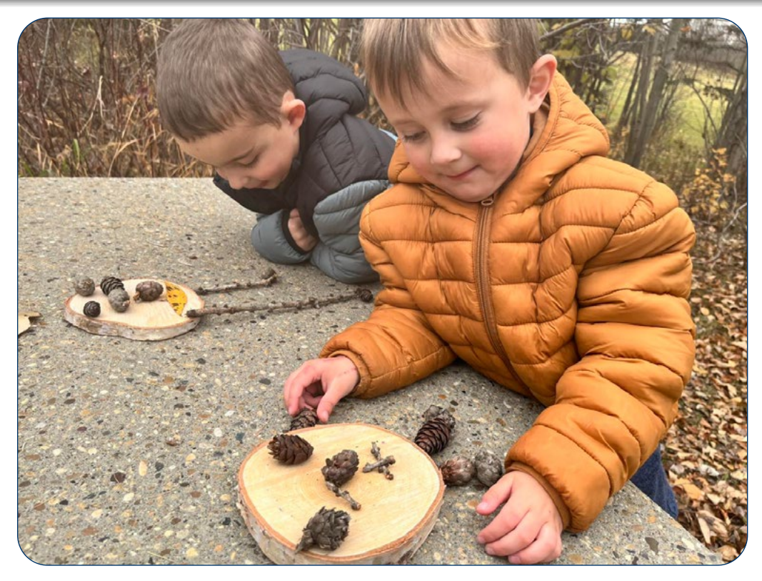
St. Luke Catholic School students create portraits using natural materials during Take Me Outside Day. See more on Page 9.