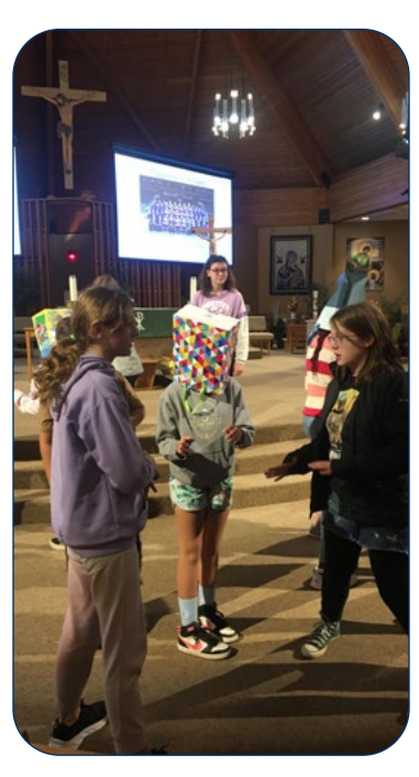
Students and staff from each of our schools participate various activities during the Here Comes the Sun Retreat that demonstrate the power of teamwork (left) and communication (right). See more photos on next page.