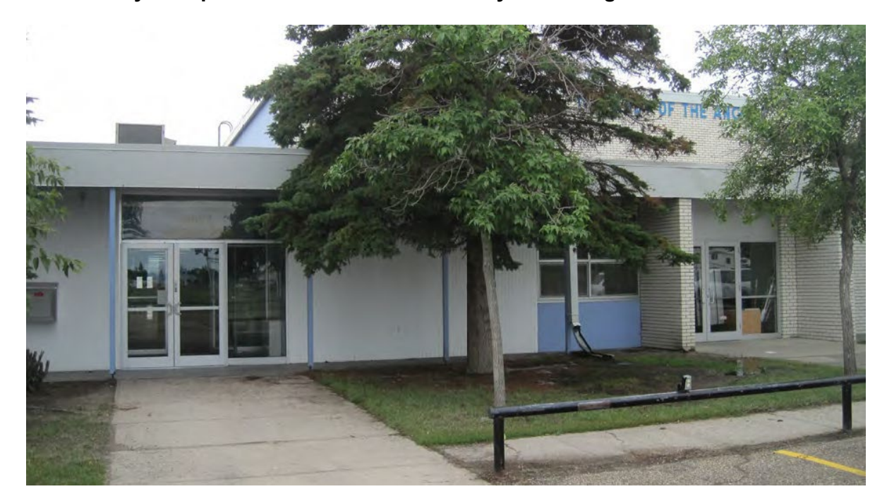
Priority 2. Replacement School for Our Lady of the Angels Catholic School