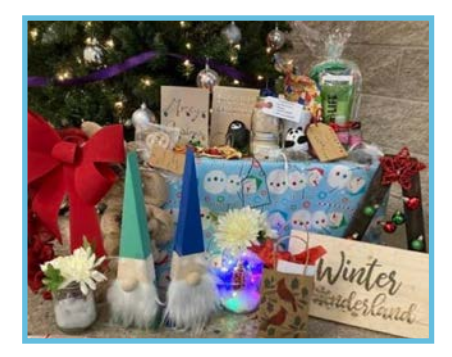
Grade 9 students took place in marketplace, where they made and solid items – all proceeds went to charity.