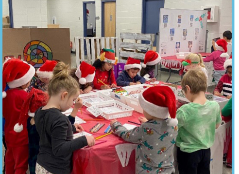
Delivering cards to local senior citizens