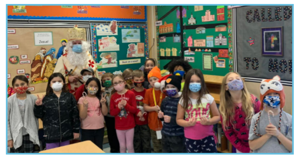
St. Martin's Catholic School in Vegreville had a visit from St. Nicholas