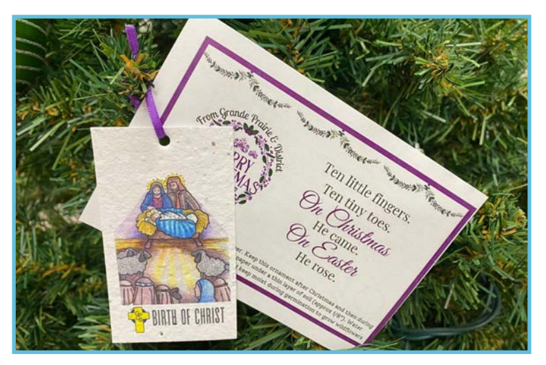
All our school families were gifted an ornament from GPCSD. The ornaments were printed on seed paper, which families were encouraged to plant for the Easter season.