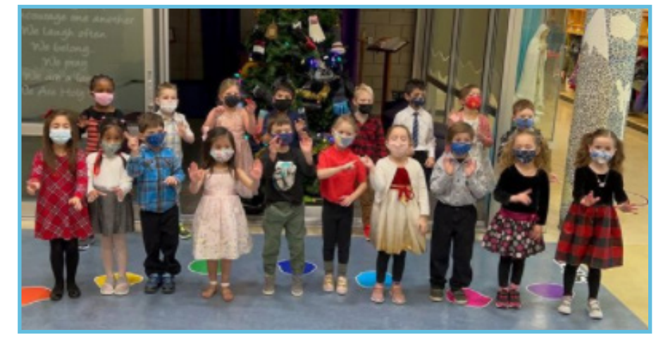
Holy Spirit's Virtual Advent concert to spread joy to our families.