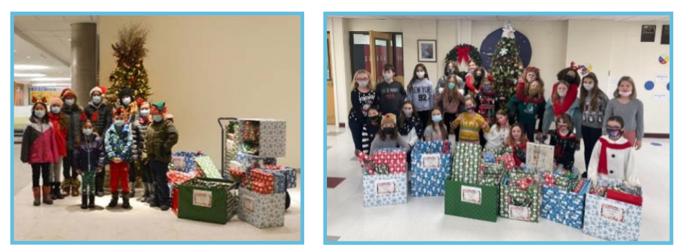
Donating Christmas gifts to children spending the holidays in the hospital