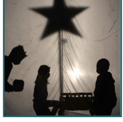
Lakeland Catholic Schools